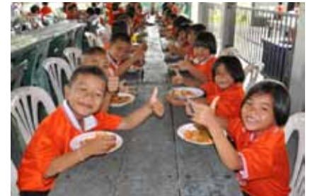
▶ TPT arranged a free lunch program at Krok Yia Cha local community school.