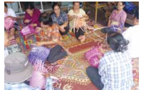
▶ Funds are provided to teach how to weave plastic baskets from plastic to supplement income for local women's groups and create good relations with the community.