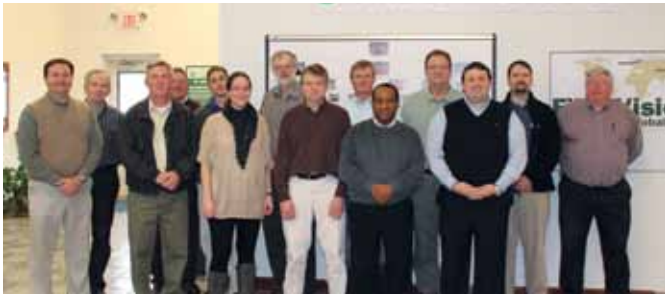
▶ FiberVisions Recent global Lean Six Sigma Conference held at our Athens, Georgia plant. Participants discussed projects undertaken in 2012, shared learning, and developed plans for 2013.