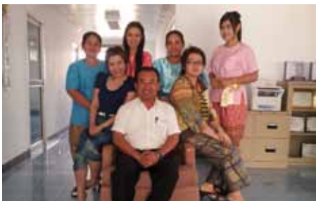
▶ IVL Lopburi donated 7,000 Baht to the event commemorating H.M. King Narai the Great at Lopburi on February 14–22, 2013. IVL Lopburi staff also supported this event by wearing traditional Thai costume throughout February 2013.