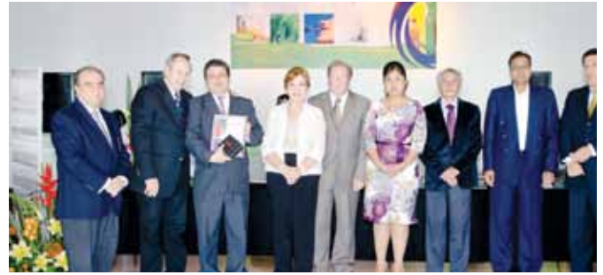
▶ IVL Mexico Management granted Seniority Awards to 76 employees to commend their responsibility, loyalty and effort to achieve the company goals.