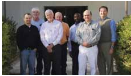
➤ Auriga Polymers Operations personnel visited FiberVisions' Covington and Athens, Georgia, plants to share and exchange ideas on improving plant operations.