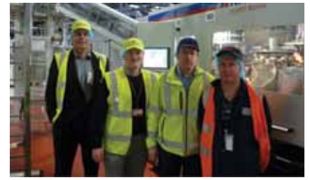
➤ Successful test of the new reheat resin, RAMAPET R182C, from IVL Workington at Coca Cola Hellenic.