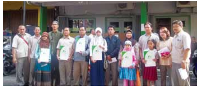
▶ PTIVI Indonesia - Jamsostek's Scholarship Program provides student scholarships. Awards were given as Indonesian Rupiah 2.400.000/ person per year for high school and university level, IDR 1.800.000/ person/ year for elementary - junior high school level.