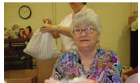
▶ Auriga Polymers donated a bale of fiber to the Pioneer Ladies Group who created heart-shaped pillows to comfort heart patients and ease their pain.