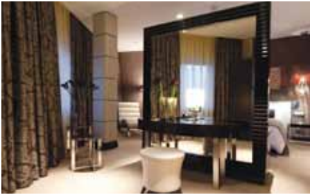
➤ Trevira Heimtextil arranged a press conference on November 30, 2012 at the Hilton Hotel in The Squire, Frankfurt Airport. The room interior was decorated with Trevira CS materials.