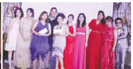
▶ IVL Head Office New Year Party at on December 7, 2012 at Siam Kempinski Hotel.