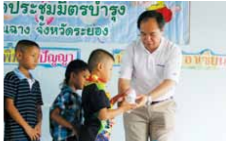
▶ Indorama Petrochem Limited provided toys to Wat Prachummirt School on the occasion of Children's Day.