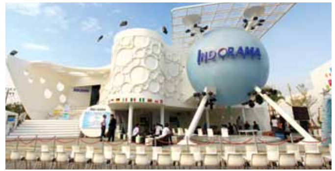
IVL Pavilion at BOI Fair 2011

The objectives of RECO are to Reduce, Reuse and Recycle waste to make Ecologically friendly products. This means that we aim to make people aware of how what others think of as waste can actually be used beneficially as fashion and furniture. We also wanted to help kick-start careers for young people who are about to enter, or recently entered, the design world by giving them an awareness of alternative materials.