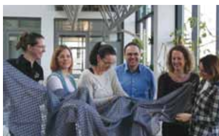
▶ Customer Service Desk colleagues at Tervira in Hattersheim pose with a Trevira CS fabric submitted by a customer for trademark testing.