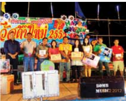
▶ New Year Party at Aurus Speciality Co., Ltd.