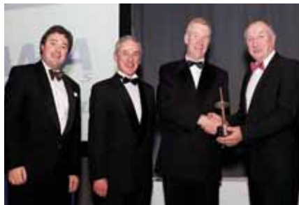
Wellman International Ltd. (Ireland) won the Irish Sustainable Exporter of the Year 2012.