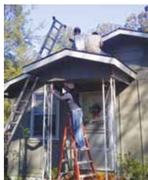
▶ Volunteers from AlphaPet worked with Habitat for Humanity to paint one house and put vinyl siding on two other houses in a neighborhood southeast of Decatur.