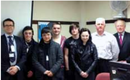
▶ The chemistry students from Maryport's Nethrelands School visited Indorama Polymers Workington Limited in UK.