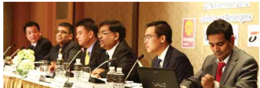
IVL organized a presentation on November 20, 2012 to announce a new debenture issuance.