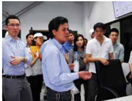
➤ IVL Head office took Thai Analysts to IVL's Lobburi plant on December 11, 2012.