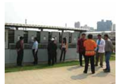
➤ The Department of Intellectual Property, Lobburi, visited IVL Lobburi for an evaluation of social responsibilities and to study the IVL Solar Power Plant on January 24, 2013.