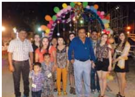
▶ New Year Party at IVL Lopburi on December 28, 2012.