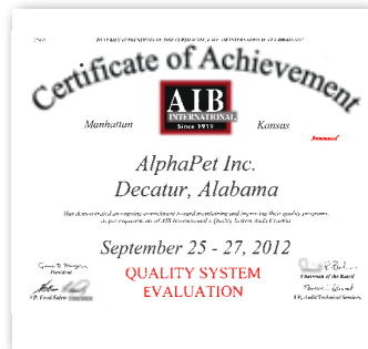
AlphaPet received the Quality System Evaluation Certificate from AIB, which is a hallmark in Food Safety and Quality system evaluation. It is only the third company in the USA to get this coveted certificate and the only one in the PET resin industry.