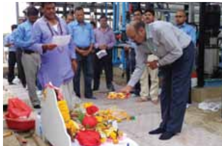
▶ Aurus Speciality Co.,Ltd. arranged a Pooja ceremony at the running R.O. Plant on Wednesday January 16, 2012 at the Biogas Plant