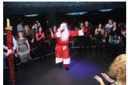
▶ New Year Party at Orion Global Pet