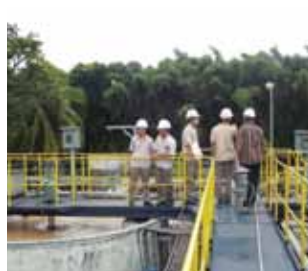
➤ IVL Indonesia was audited by SGS Indonesia regarding The Supplier Ethical Data Exchange (SEDEX), on January 7-8, 2013.