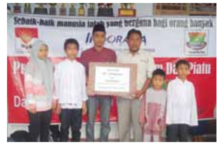
▶ PT Indorama Ventures Indonesia donated IDR 1,000,000 to orphanages and poor elderly people in Cihuni area on November 25, 2012 on the occasion of Islamic New Year's Day.