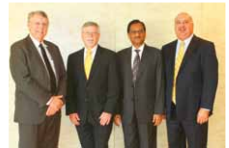
The IVL Oxide & Glycols team from the U.S. visited IVL Head Office on November 27, 2012.