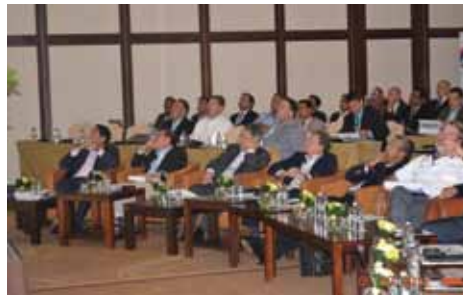
Global PET Conference at Warsaw, Poland, on September 4-6, 2012.