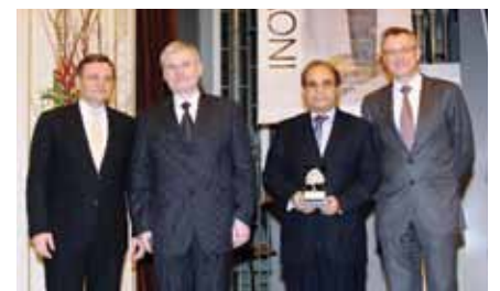
Orion Global Pet was recognized as the Best Chemical Company in Lithuania for 2012 by the Lithuanian Industrialists Confederation.