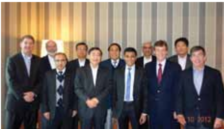
➤ IVL and FiberVisions met in October and December with JNC, our partner in ES FiberVisions, to advance bicomponent fiber expansion plans in Asia.