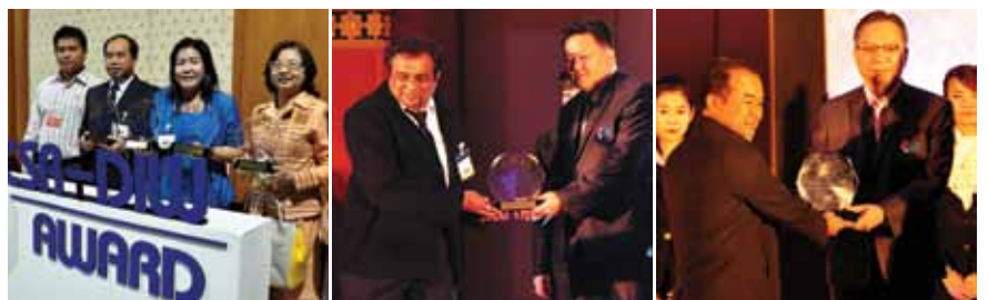
Subsidiaries of Indorama Ventures - Indorama Polyester Industrial Nakhon Pathom, Asia Pet, Petform, Indorama Polymers, Indorama Petrochem and TPT Petrochemicals - received the CSR-DIW Continuous Award on December 19, 2012 at Muang Thong Thani, Bangkok.