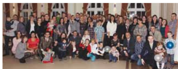
▶ New Year party at IVL Poland