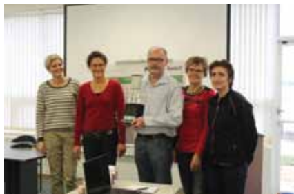
▶ FiberVisions Denmark received the 2012 FOX (FiberVisions Operational Excellence) site award at FiberVisions FOX Conference in Athens, Georgia on December 6, 2012. (Picture)