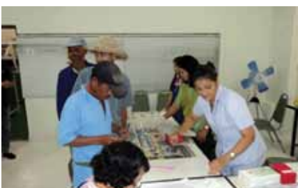
➤ Indorama Holdings cooperated with Ta Klong Police Station in the White Factory Project, an anti-drug campaign at the workplace, at our Lobburi plant on January 28, 2013.