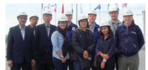
IVL Board of Directors and Thai media visited IVL Wloclawek Plant in Poland on September 7, 2012.