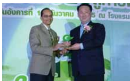
Indorama Polyester Industries (Nakhon Pathom) received the Green Industry Level 4 (Green Culture) Award from the Ministry of Industry.