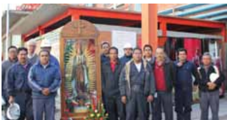
▶ Employees from the Querétaro Complex held a celebration in honor of the Guadalupe Virgin, a tradition to share the values of the company. As part of the festivity, there was a group of dancers, cultural activities, health promotion and craft classes.