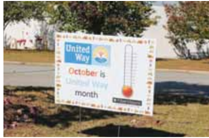
➤ FiberVisions' Athens plant held a fundraiser for the United Way in October. There was an employee barbeque cookout and over $2,000 was raised for the charity.