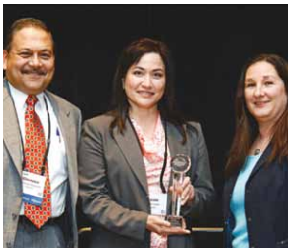
Indorama Ventures Innovation Helps Customer to Win Award

Immediately after Capital Market Day, management turned to fine-tuning their corporate strategies for the year. This was the first time a focused team of high level management was brought together to meet, discuss and make their plans for the year. This was then presented to and approved by the Board of Directors.