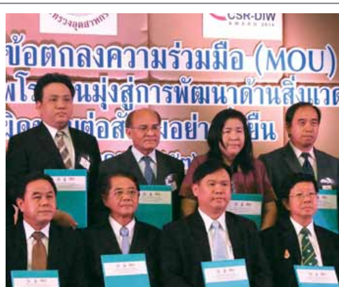
▶ Seven subsidiaries of Indorama Ventures; AsiaPet, Indorama Polymers, Petform, Indorama Holding, Indorama Polyester Industries (Nakhon Pathom and Rayong), Indorama Petrochem and TPT participated and signed the CSR-DIW MOU at the ceremony held by the Department of Industry Works at IMPACT Muang Thong Thani.