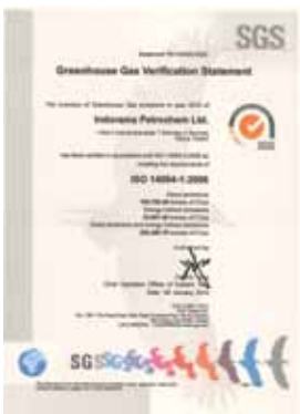
▶ Indorama Petrochem Limited has received a Greenhouse Gas Verification Statement from SGS Taiwan verifying that its inventory of Greenhouse Gas Emissions 2012 meets the requirements of ISO 14064-1:2006.