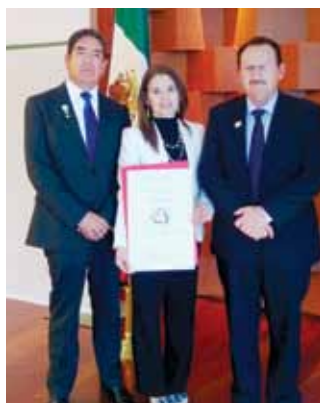
▶ Indorama Ventures Mexico received the Family Responsible Distinctive Award from the Labor and Social Welfare Ministry after an exhaustive audit to verify their application of best practices in “conciliation in work and the family”.