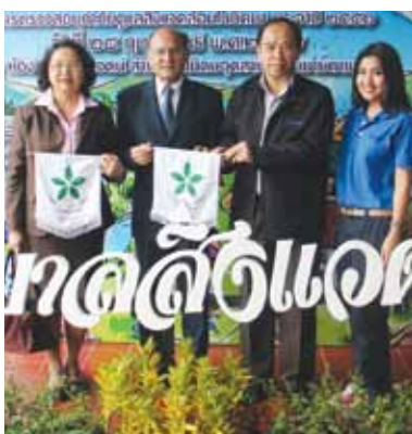
▶ Indorama Polyester Industries Rayong and TPT Petrochemical Pcl. received an award for “Good Environmental Governance 2013” (White Flag - Green Star) from Mr. Peerawat Rungruengsri, Deputy Governor of the Industrial Estates Authority of Thailand at Map Ta Phut Industrial Estate Office.