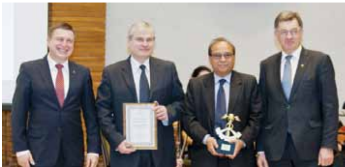
▶ Orion Global Pet received the Export Prize 2013, an award for exporters in Lithuania, at the parliament of the Republic of Lithuania on 20 February 2014.