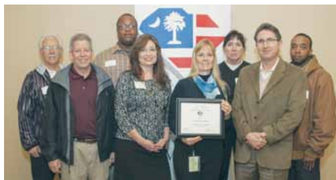
▶ Auriga Polymers received the 2013 Award for Excellence for the factory’s safety program.