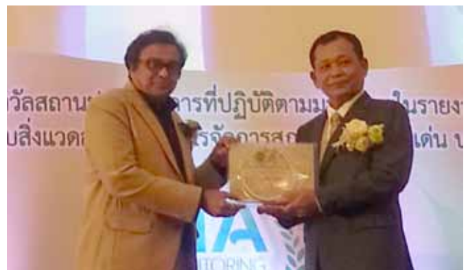
• Asia Pet (Thailand) received the Environmental Impact Assessment (EIA) Monitoring Award 2014 presented by the Ministry of Natural Resources and Environment Thailand. The award was given to organizations for having an excellent environmental impact assessment report and environmental management.