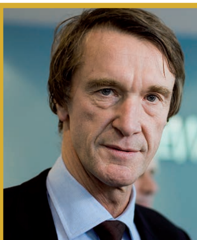
1 JIM RATCLIFFE CHAIRMAN INEOS

He added that INEOS' profits in Europe have halved in the last three years, while profits in the US – where energy costs are 50% below Europe – have tripled. He pointed out that new builds